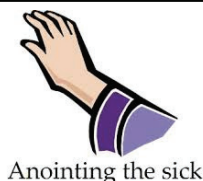
Anointing the sick

We will celebrate this special sacrament on Monday, June 24th at 10 am, Tuesday June 25th at 10 am and Thursday, June 27th at 7 pm.